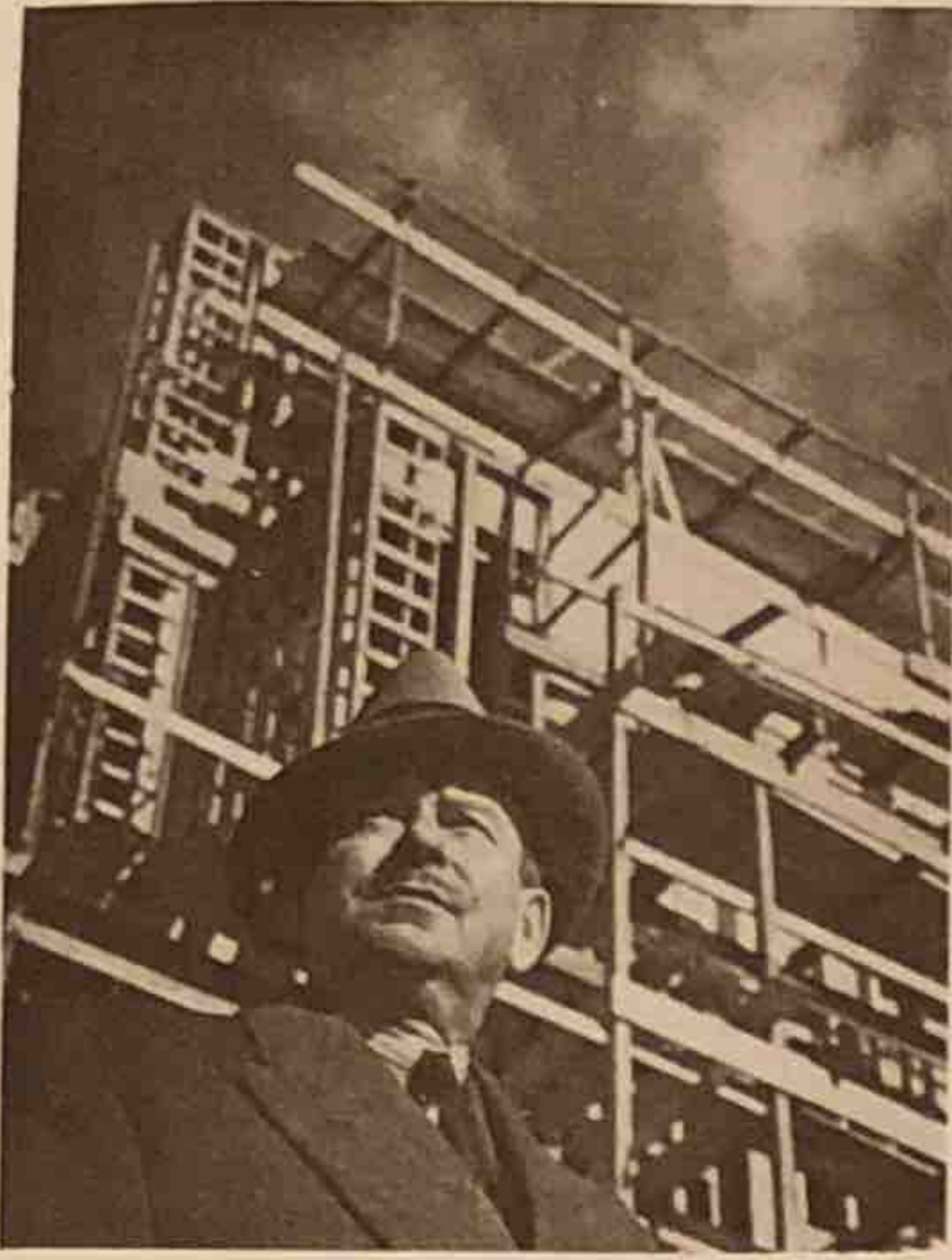
Walter Dorwin Teague silhouetted against the World's Fair Ford Exhibit he designed